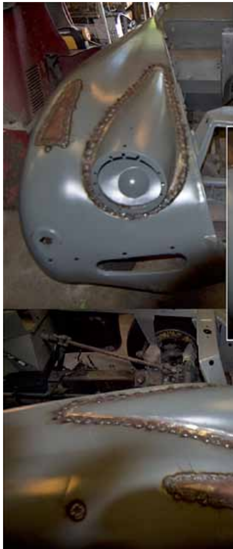
Riveting in the headlight pod

EXCEPTIONAL TASTE DESERVES EXCEPTIONAL TREATMENT.