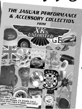
80 page Vol. I, Jaguar Performance & Accessory Collection