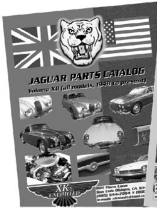
384 page Vol. XII, Jaguar Parts Catalog