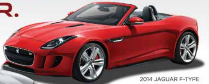
2014 JAGUAR F-TYPE