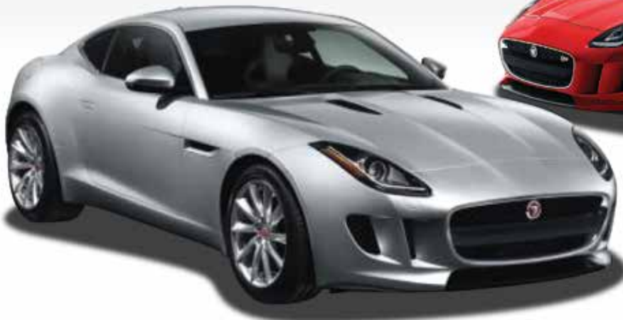
ALL-NEW 2015 JAGUAR F-TYPE Coupe

MAKE EVERY JOURNEY UNFORGETTABLE IN A NEW JAGUAR.