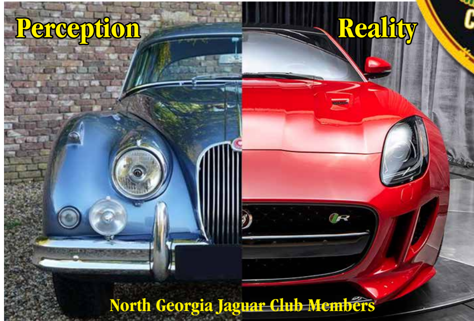
North Georgia Jaguar Club Members