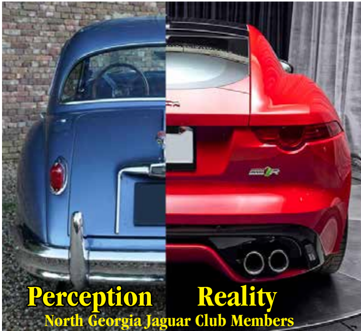
Perception Reality North Georgia Jaguar Club Members