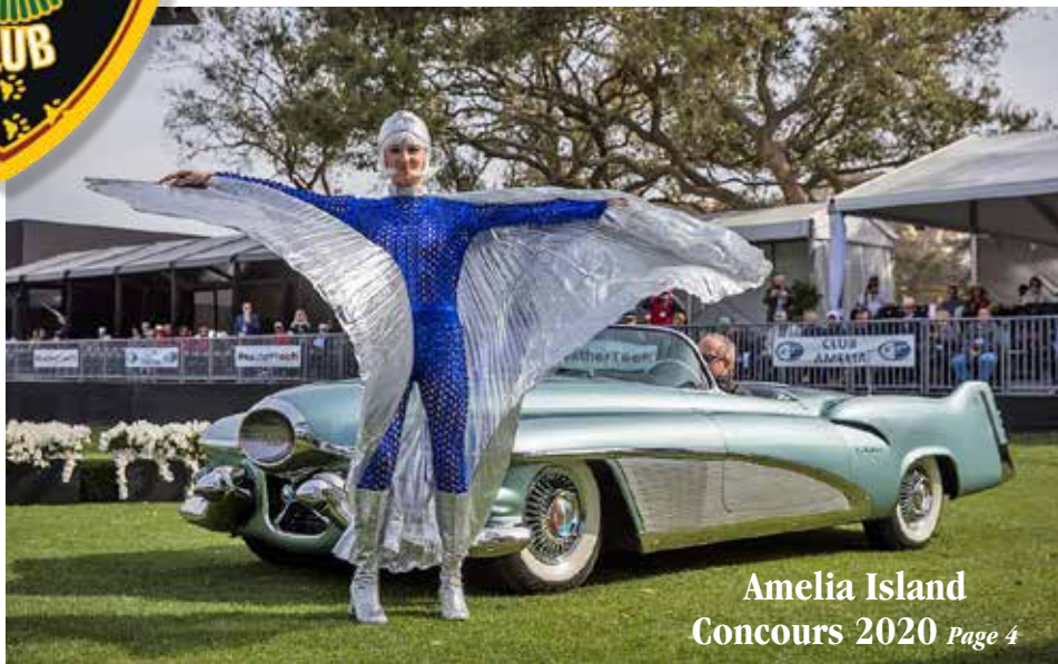
Amelia Island Concours 2020 Page 4