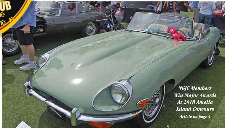
NGJC Members Win Major Awards At 2018 Amelia Island Concours Article on page 4