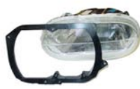
Euro headlight w/bracket XJS 92> Only $315.00 ea Bracket is currently unavailable from Jaguar!